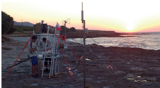
Sampling site at the Aegean Sea, north coast of Crete

A large amount of data is on substances and their transports and transformations which had never been addressed before in the region. Atmospheric modelling was further developed, such that the contributions of various sources to individual air samples can now be tracked and quantified over days and hundreds of kilometers.