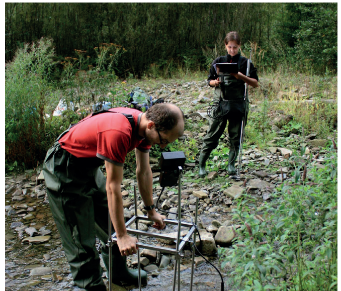
Measurement of river flow characteristics and revitalization after intervention

More information about the project is on the website www.reformrivers.eu