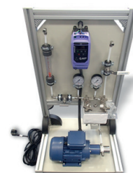
Laboratory model – reverse osmosis

developed in cooperation with ASIO, Ltd in Brno. Advances in optimization were presented at the ASIO booth at the Research, Science and Innovation Fair in Brno, Czech Republic on 9–11 March 2016. The proof of concept for this optimization is provided by a project of the Technology Transfer Office of Masaryk University (TTO) supported by the Technology Agency of the Czech Republic in the program Gama.